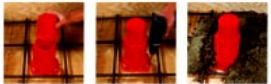
Snap the extension in place, adjust to any concrete thickness and pour.