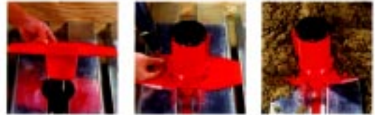
Deck Adaptor works great on uneven surfaces i.e. fluted steel pan decks.

Height Adaptor: Extension snaps into place on 3M CID, so no additional fastening is required. It adapts easily and quickly to any concrete thickness.