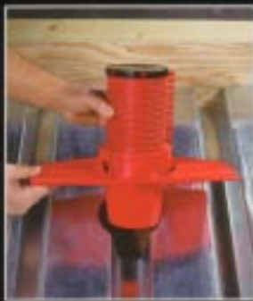
3M Fluted Metal Deck Adaptor