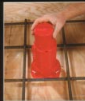
3M Height Adaptor