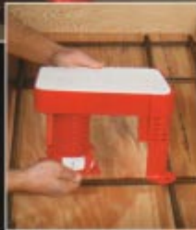
3M Tab Box