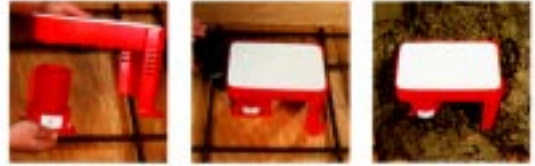
Tub box tested for 1-1/2" to 2" pipe sizes and heights of 4-1/2" to 8".